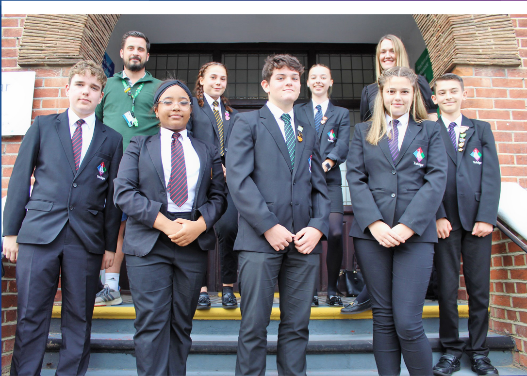
Student Heads of House & Deputies, 2021-22