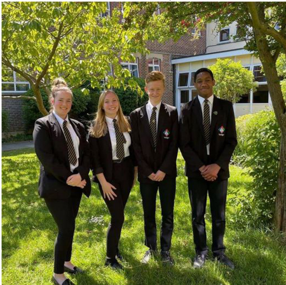
Student Senior Leadership Team, 2021-22

Congratulations to our Senior Student Leadership who have made a fantastic impact in their first term of office.