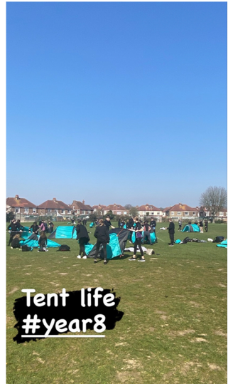
Tent life #year8