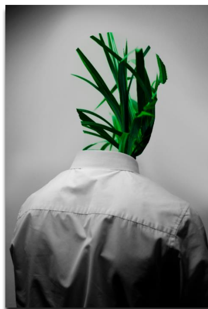
GCSE Photography student work

Our team is passionate about absolutely everything creative and between us it is our goal to provide a broad and flexible curriculum covering an extensive range of skills, techniques, and processes, constantly challenging ourselves to learn new disciplines so that we can offer our students the best possible courses built with them in mind. Our GCSE offer consists of: Fine Art, Art Graphics, Photography, Art Textiles, 3D Design and Food Preparation and Nutrition. We ensure that all students are well prepared to opt for the correct course for them through our extensive KS3 offer where we cover Graphics, Textiles, 3D Design and Food Technology through our KS3 Design Technology rotations. We also develop Fine Art and some Photography skills throughout KS3 Art lessons too. Our courses are developed and adapted regularly to suit the strengths and interests of the students, with cultural and contextual theory interwoven at every opportunity.