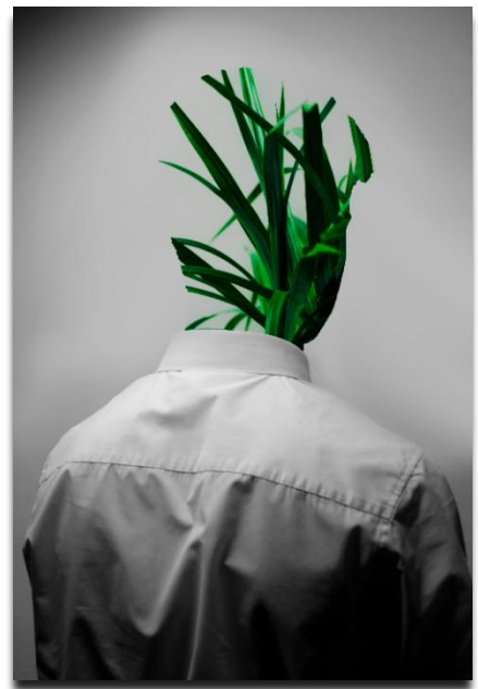
GCSE Photography student work

Our team is passionate about absolutely everything creative and between us it is our goal to provide a broad and flexible curriculum covering an extensive range of skills, techniques, and processes, constantly challenging ourselves to learn new disciplines so that we can offer our students the best possible courses built with them in mind. Our GCSE offer consists of: Fine Art, Art Graphics, Photography, Art Textiles, 3D Design and Food Preparation and Nutrition. We ensure that all students are well prepared to opt for the correct course for them through our extensive KS3 offer where we cover Graphics, Textiles, 3D Design and Food Technology through our KS3 Design Technology rotations. We also develop Fine Art and some Photography skills throughout KS3 Art lessons too. Our courses are developed and adapted regularly to suit the strengths and interests of the students, with cultural and contextual theory interwoven at every opportunity.